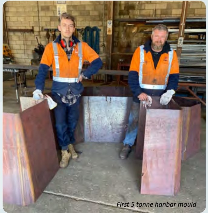
First 5 tonne hanbar mould

A few big contracts have been announced including local firm C Hayes Engineering who will be making the large steel moulds for the concrete hanbars. The concrete hanbars are a vital component of the seawall design providing stable armouring to the seawalls to help them withstand wave action and tides over many years.