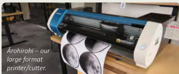
Ārohirohi – our large format printer/cutter.

Our large format printer/cutter, Ārohirohi, has been hard at work producing vinyl stickers and other creative designs for our customers. As well as producing large and small stickers on two different types of vinyl material, we have recently added glossy photo paper which allows for beautiful photo prints.