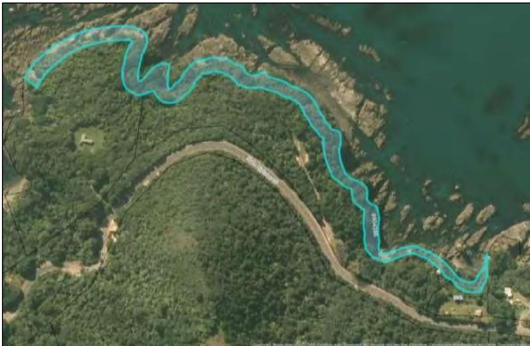
State Highway 35 (Te Kaha)

The Tokatea reserve is an area of some 1.7345 hectares just a few kilometers to the east of Whanarua. You will see that its block name is Motuaruhe 6B1 which indicates that it is part of the original Motuaruhe block which included the Whanarua Bay lots 66 and 80.