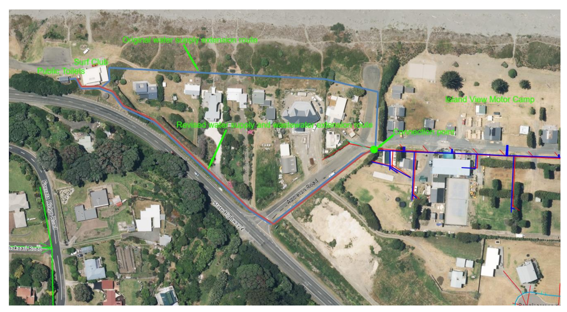
Figure 1: Waiotahe Public Toilets Wastewater and Water Supply Extensions