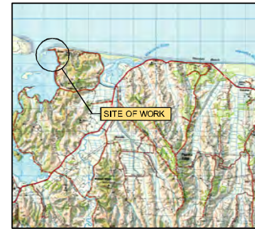
LOCALITY PLAN N.T.S.