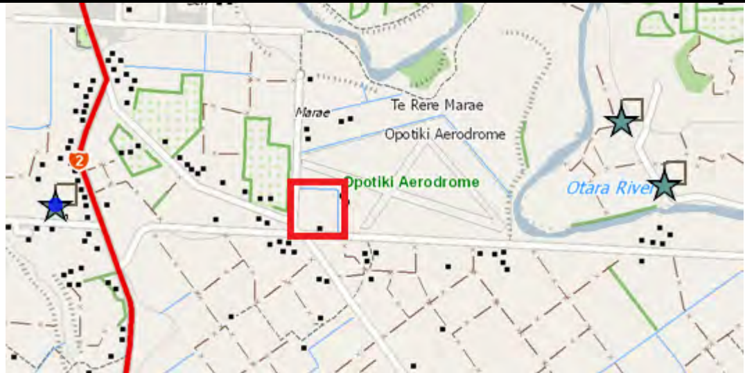
Red square shows the second area in question – at the junction of Otaru and Te Rere Pa Roads