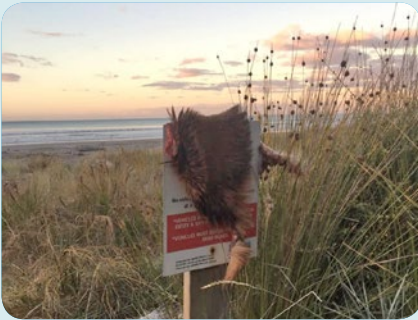
In this case a member of the public let Council know about the littering and sent photos of the vehicle involved. We were able to track the licence plate back to an owner and issue infringement notices.