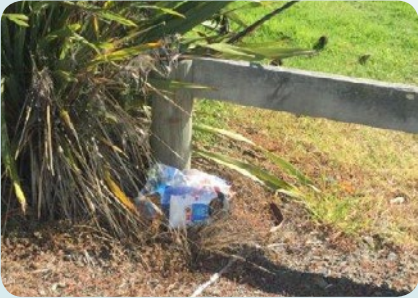
Bag of rubbish at pipi beds

But 'self-contained' means just that – no littering of any sort. Council has issued a number of infringement notices to campers when they have left their litter behind.