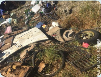
The owners of this mess were fined more than $1600.

Litter, big or small, is a bad look for our town. When Council is alerted to a dump site, we will arrange clean-up of the area and do our best to track down who is responsible.