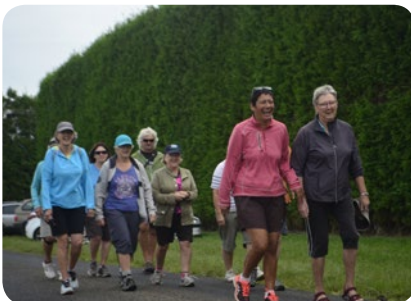
Ōpōtiki Community Walking Group

Ōpōtiki has dozens of clubs, societies, sports groups, support groups and informal groups for all sorts of interests. There is always a great range of interesting events and activities including the Harvest Festival Dinner at Nukuhou North Settlers Hall on 26 April. Find out more about them from the friendly staff at the i-SITE.