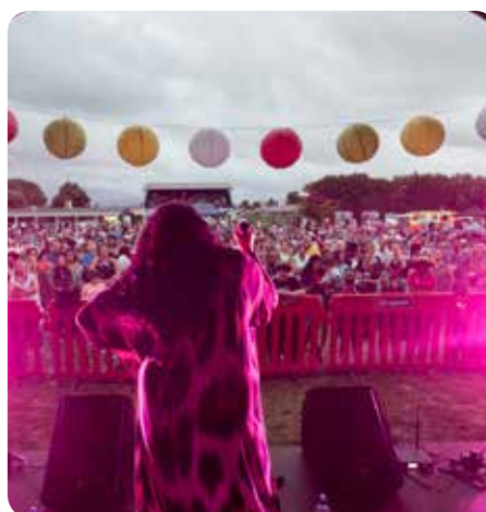
This summer's spectacular Lantern Fest.